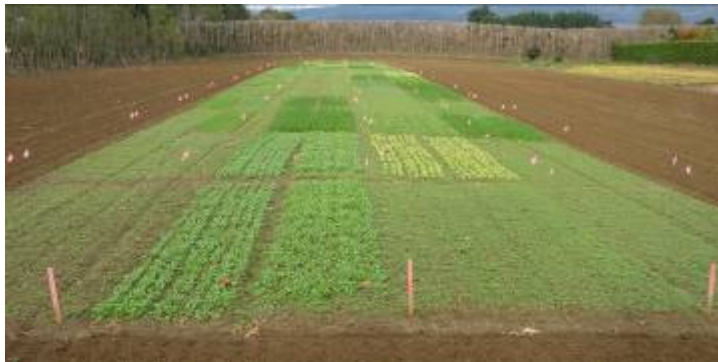
Cover crop trials, sown May 14th at early establishment

Cover crops used, other than the mustards, included annual ryegrass, oats, triticale, blue lupins, chicory, blue lupins and peas, common vetch, buckwheat, wheat, hairy vetch and oats, phacelia and clover.