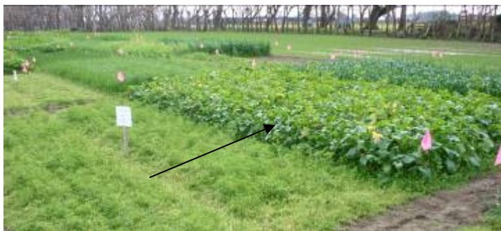
Later photos taken late July. Caliente Mustards marked

If you would like to know the final results from these trials once they are finished later in spring, we would be glad to let you know how the various crops performed. On viewing the trials two weeks ago, the mustards and oats looked to be producing the most biomass.